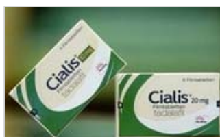
Two boxes with the new anti-impotence drug Cialis (tadalafil) are pictured in a Munich pharmacy...